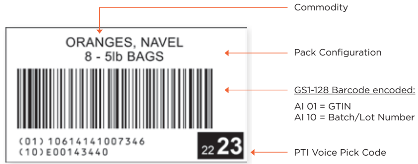
Figure 4: PTI compliant case label encoding barcode with GTIN and Batch/Lot data for traceability.

As an example, in 2008, The Produce Traceability Initiative (PTI) was created to address case-level traceability with the active involvement of working groups representing every aspect of the produce supply chain. PTI incorporates the use of GS1 Standards for product information to efficiently track products and establish electronic recordkeeping of product data from farm-to-store or farm-to-restaurant. The reason the PTI decided to use GS1 Standards is that the grocery channel is already heavily invested in these standards for consumer packaged goods.